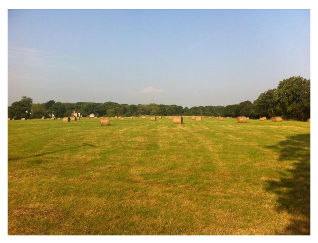
Rosemead farm: before the diggers moved in

Rural fields on a ridge overlooking ANOB.