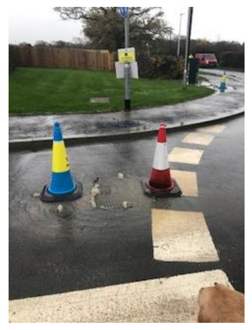
Regular flooding on Horebeech Lane after Rosemead was built