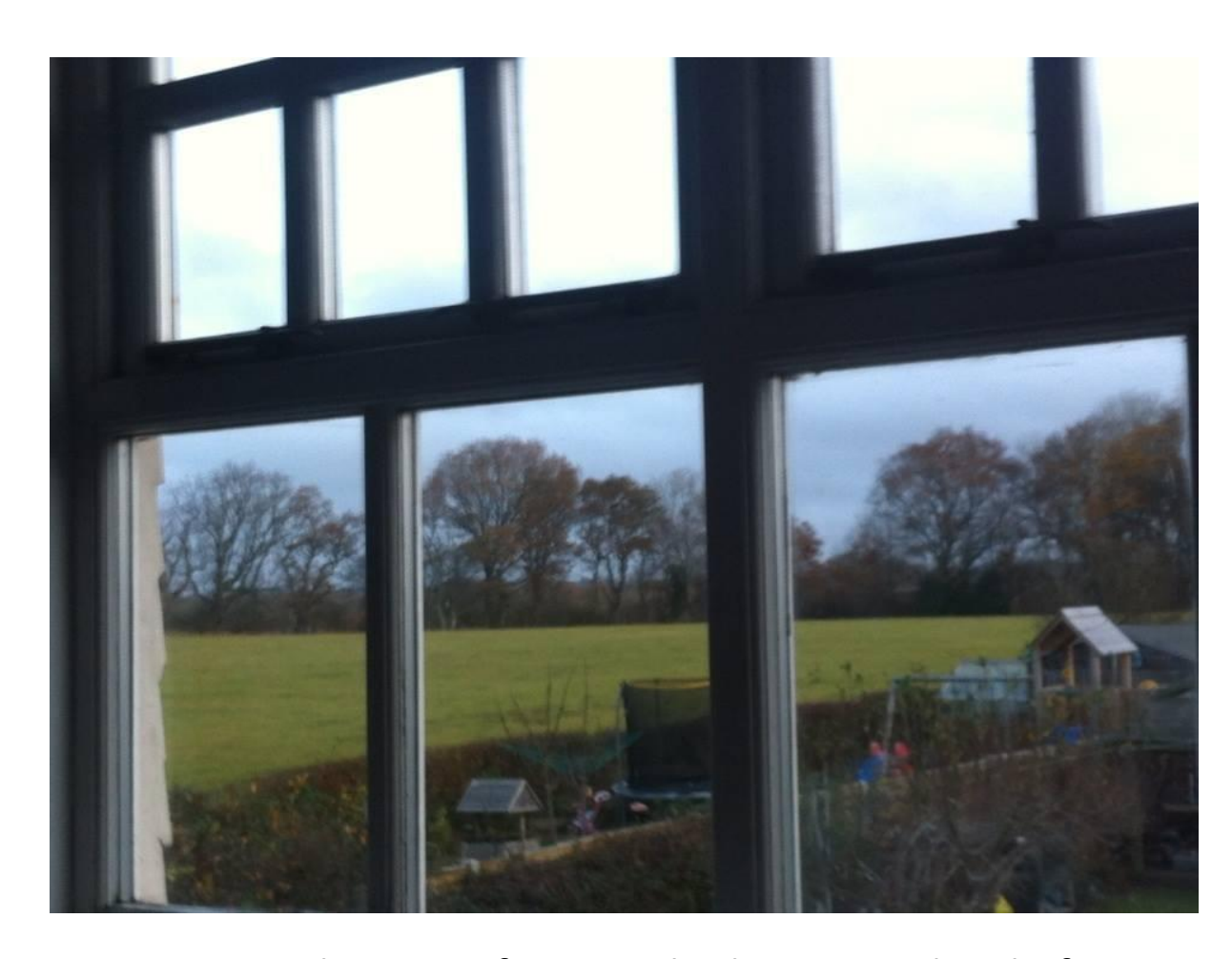
Rosemead: picture from our bedroom window before Rosemead estate was built in 2017

They key is to share the successes with local people to ward off the apathy that naturally sets in after several objection letters are sent by individuals and applications still get approved and to maintain the pressure on those in power.